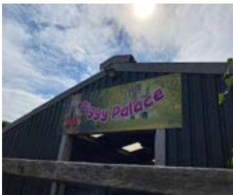
Ramp to Piggy Palace