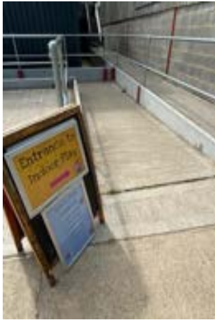
Entry doors for play area