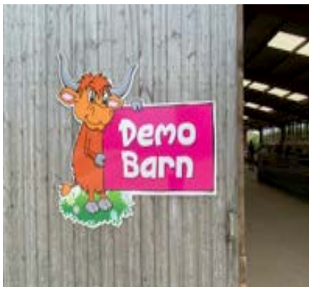
Demo barn floor