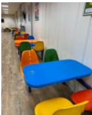
Tables in the cafe are well spaced apart and have smooth plastic seating without arms.