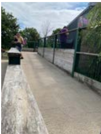
Entrance to tractor ride