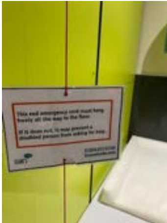
Low level basins