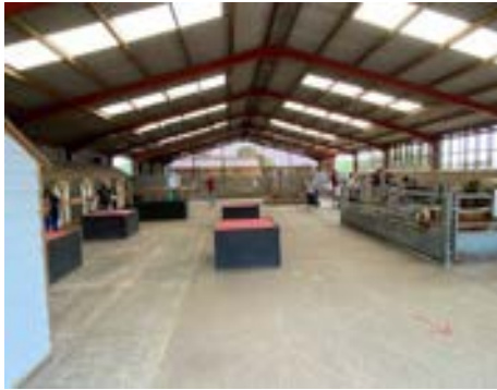
Piggy Palace Entrance