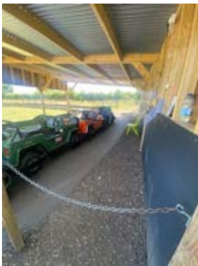
Textures and Surfaces