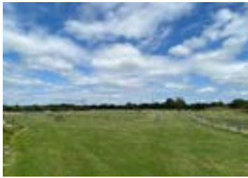
Shaggy's On Road Adventure