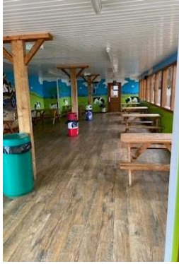
Standard picnic bench. This is 32 inches from the floor