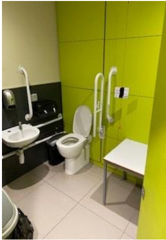
Euans Guide in place