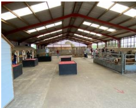
Piggy Palace Entrance